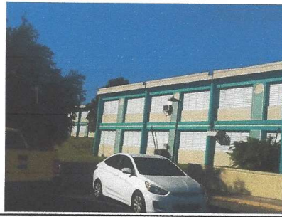
Parte trasera escuela