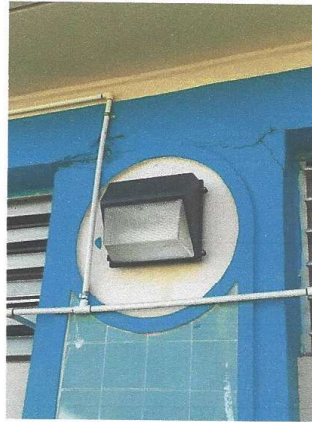
Grietas en el empañetado de fácil corrección