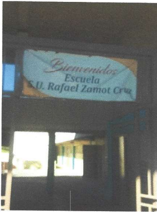
Escuela Rafael Zamot Cruz