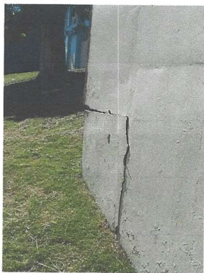
Grieta en pared de bloques de fácil corrección